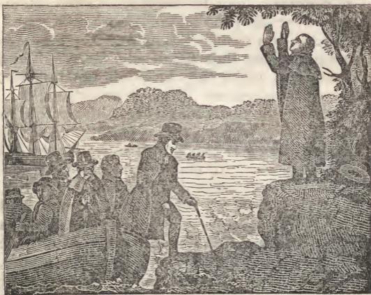
Landing of the Fathers.

obtain from him was a promise that he would connive at their infringements of the statutes, the operation of which had driven them into voluntary exile. On the faith of the royal word to this effect, they embarked, to the number of 101, in the month of September, 1620, and arriving at Cape Cod in the following November, soon afterwards fixed themselves in a place of settlement which they called New Plymouth, and which, it must be observed to their honor, they purchased from the natives.